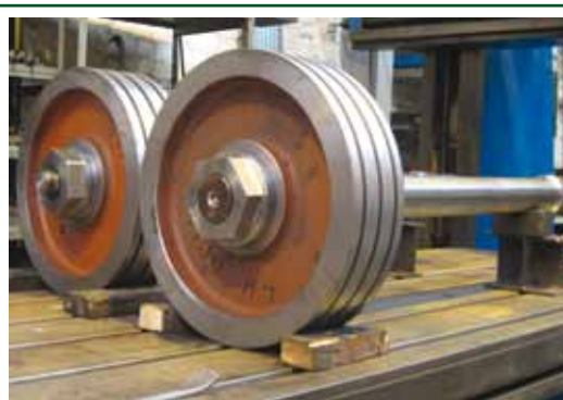
Brand new Pistons and Re-Engineered Piston Rods for Locomotive BIG JIM

Acetarc Engineering are a family based company who are proud to work with local Heritage based societies. From full bespoke fabrications to re-engineering existing components, we pride ourselves on our ability to cover a vast array of projects from restoring or replicating, working to original drawing or sketches, working from an original part to re-drawing the component ourselves.