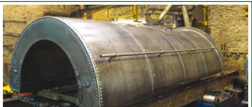
Newly manufactured Saddle Tank for Lancashire & Yorkshire Railway Engine No:752 manufactured from the original