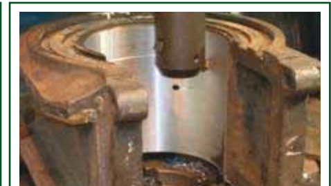
Re-Engineering of Brake Shoes. Re-sleeved with cast iron and white metal and machined to original tolerances