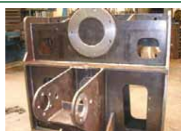
New Drag Box Fabrication, fully machined, manufactured against original example.