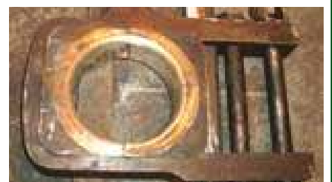
Re-Engineering of Con Rod Big Ends white metal coated and machined to original tolerances.